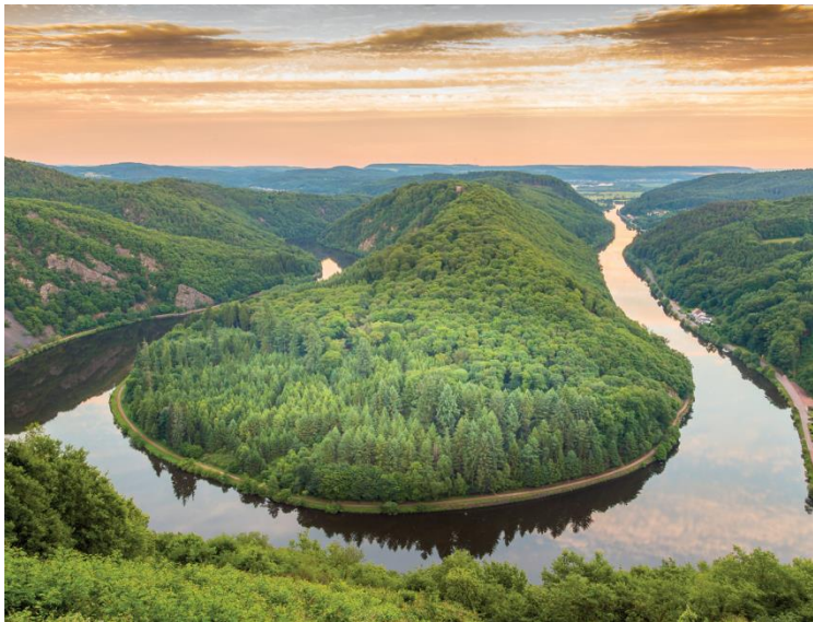
Landmark of Saarland: The Saar Loop near Mettlach