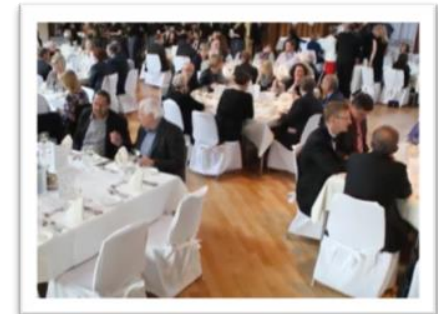
Gala dinner at the International Week